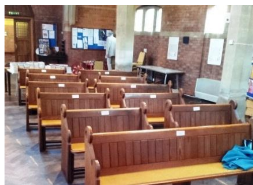
Dividing the pews into two halves (most were sold to members of the congregation)