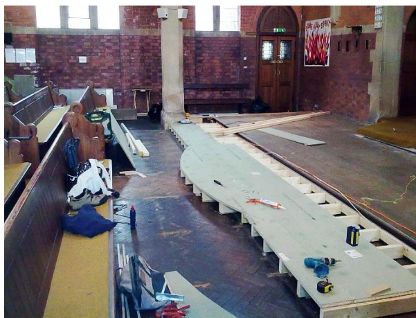
Extending the raised area