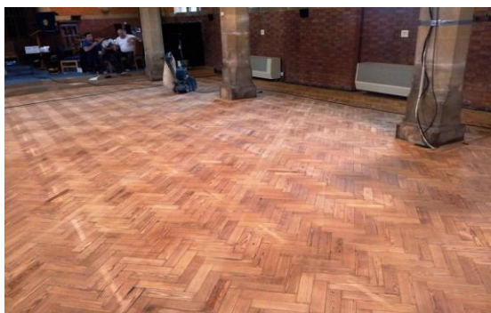
Floor sanded, but not yet varnished